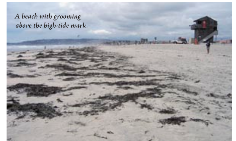
A beach with grooming above the high-tide mark.

“You can’t ignore the public and various concerned groups,” Simmons says. “We share the