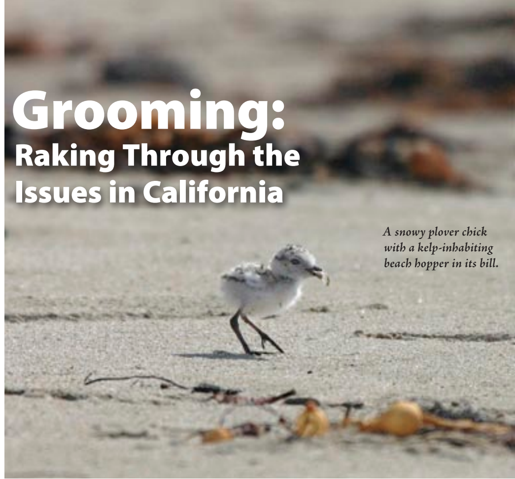
A snowy plover chick with a kelp-inhabiting beach hopper in its bill.

Each year, from March through July, grunion lay eggs in the sand on the beaches in Southern California, including many of the beaches in San Diego.