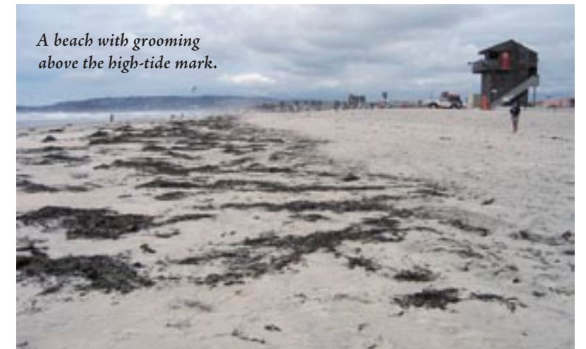
A beach with grooming above the high-tide mark.

“You can’t ignore the public and various concerned groups,” Simmons says. “We share the