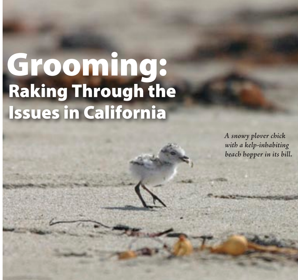
A snowy plover chick with a kelp-inhabiting beach hopper in its bill.

Each year, from March through July, grunion lay eggs in the sand on the beaches in Southern California, including many of the beaches in San Diego.